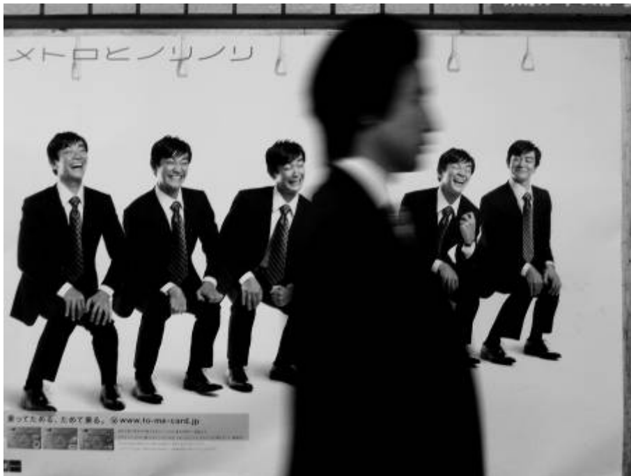
Xavi Comas Pasajero/Passenger 2007 Video projection and prints Singapore Art Museum Collection

The Singapore Art Museum (SAM) is proud to present TransportASIAN , its first photography exhibition featuring Southeast Asian-based artists. The composite term, TransportASIAN captures travel in time and space within Asia. The works not only document the history of transportation in Asia, they are also interpretations and metaphorical explorations on the theme of travels. TransportASIAN showcases works by 15 artists from Singapore, Myanmar, Vietnam and Thailand in the way their photographic works relate to Time, Space, Action and Fiction.