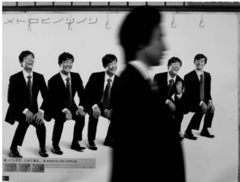
Xavi Comas Pasajero/Passenger 2007 Video projection and prints Singapore Art Museum Collection