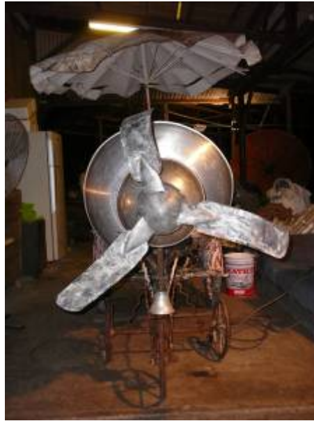
Mark R Kaufmann The Fabulous Flights of Fancy Time Machine 2009 Interactive photo installation Singapore Art Museum Collection