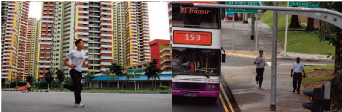
Jun Nguyen-Hatsushiba Breathing is free 2009 Video installation Singapore Art Museum Collection