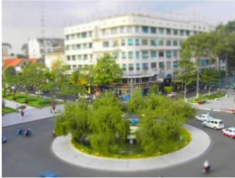
Rich Streitmatter-Tran The Jungle Book 2009 Photo series Singapore Art Museum Collection